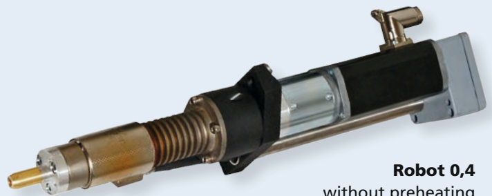
Robot 0,4 without preheating